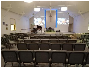
Islington Baptist Church