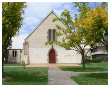
St John's Anglican Church, Cooks Hill

Quiet room: A well- prepared quiet room is available off the front foyer.